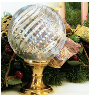
#581245 blown lead crystal