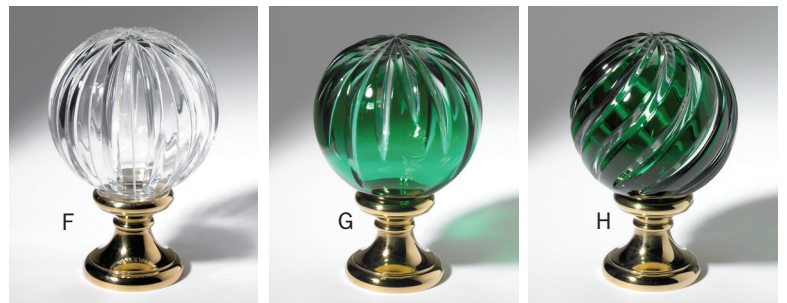
A. #581228 blown lead crystal B. #581243 blown lead crystal C. #581249 blown lead crystal D. #581244 blown lead crystal E. #581240 blown lead crystal F. #581222 blown lead crystal G. #581269 (R,G,B) blown lead crystal (2-colored) H. #581266 (R,G,B) blown lead crystal (2-colored)