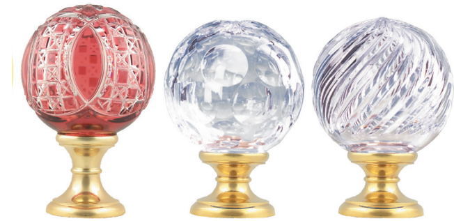
#581268 (R,G,B) blown lead crystal (2-colored) #581226 blown lead crystal *low base #581224 blown lead crystal *low base