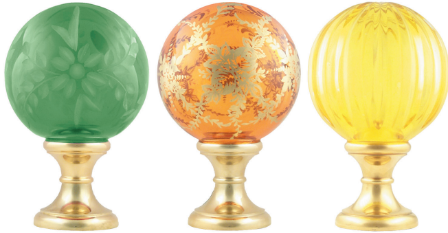
#581247 blown lead crystal *carved #581251 blown lead crystal *painted #581242 blown lead crystal

Use this color key to specify crystal color other than clear (for blown finials) when you place your order. Finial bases are standard in polished brass but you may specify antique brass, brushed brass, brushed nickel, old black or polished chrome for an additional charge.